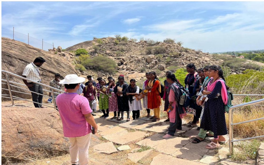
Professors and I B.A., Students, Rock cut temple

The field experience proved to be academically rewarding and intellectually stimulating, as it enriched the students' knowledge of both monumental studies and field archaeology.