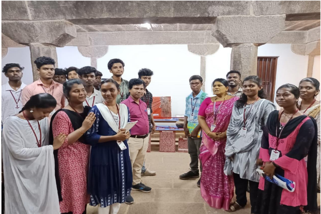
Asst. Professors and I B.A., Archaeology Students