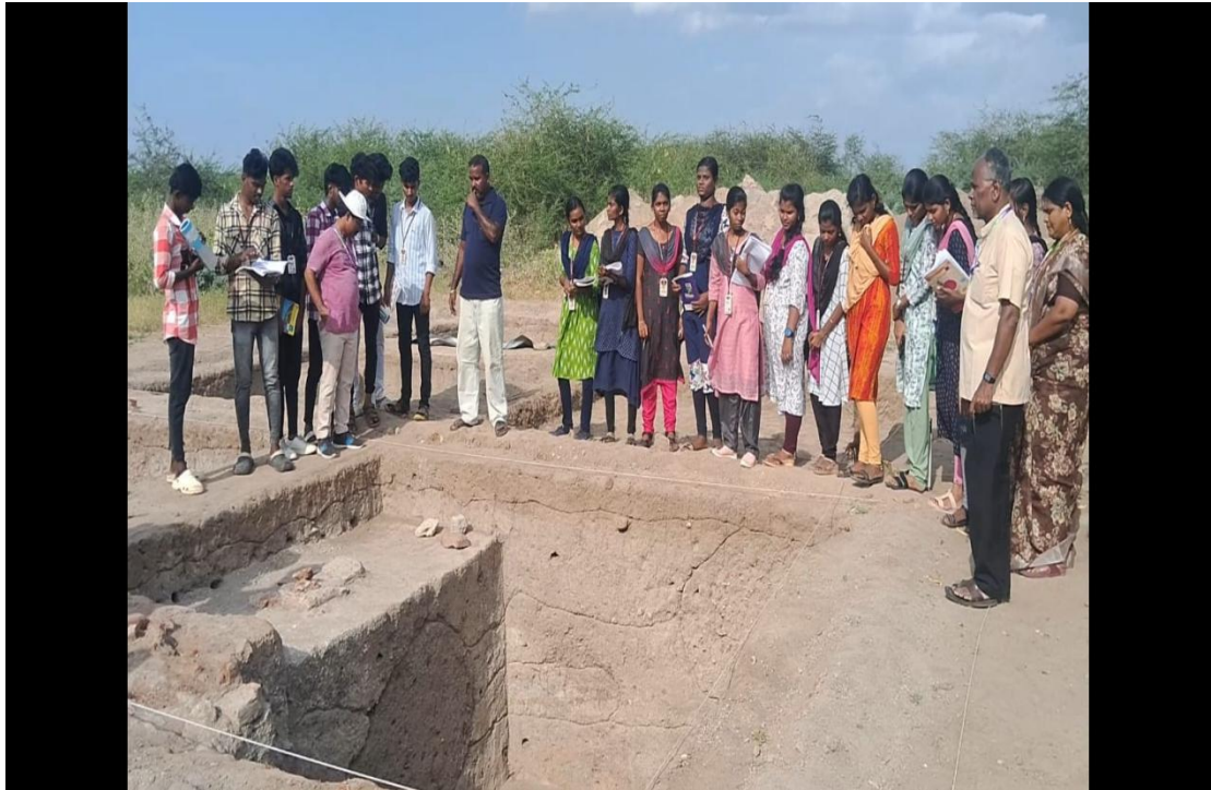
Professors, Archaeologist and I B.A., Students Vembakottai site