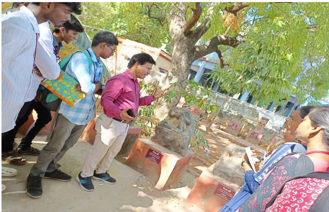
The Asst. professor offered an interpretation of the sculptural representation of Goddess