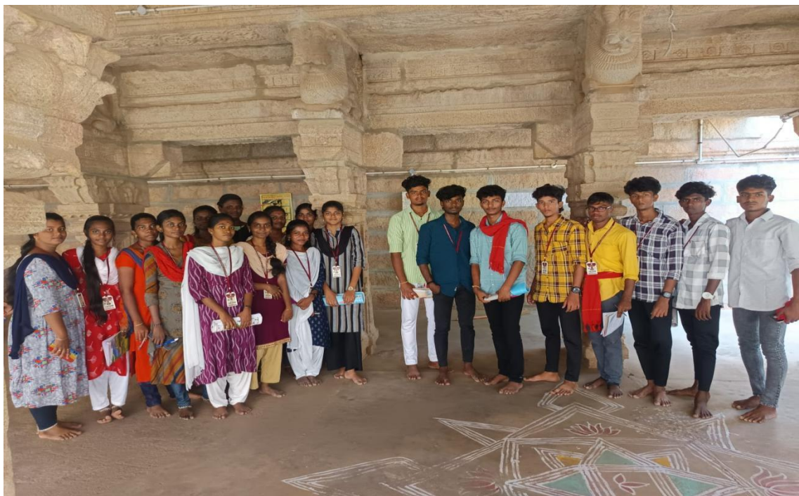
I B.A., Archaeology Students