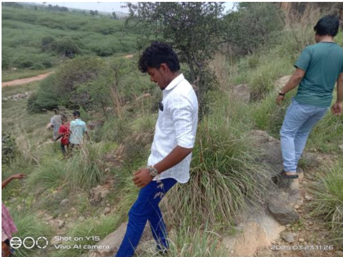
I B.A., students exploring Early Historical site, Marukalthalai