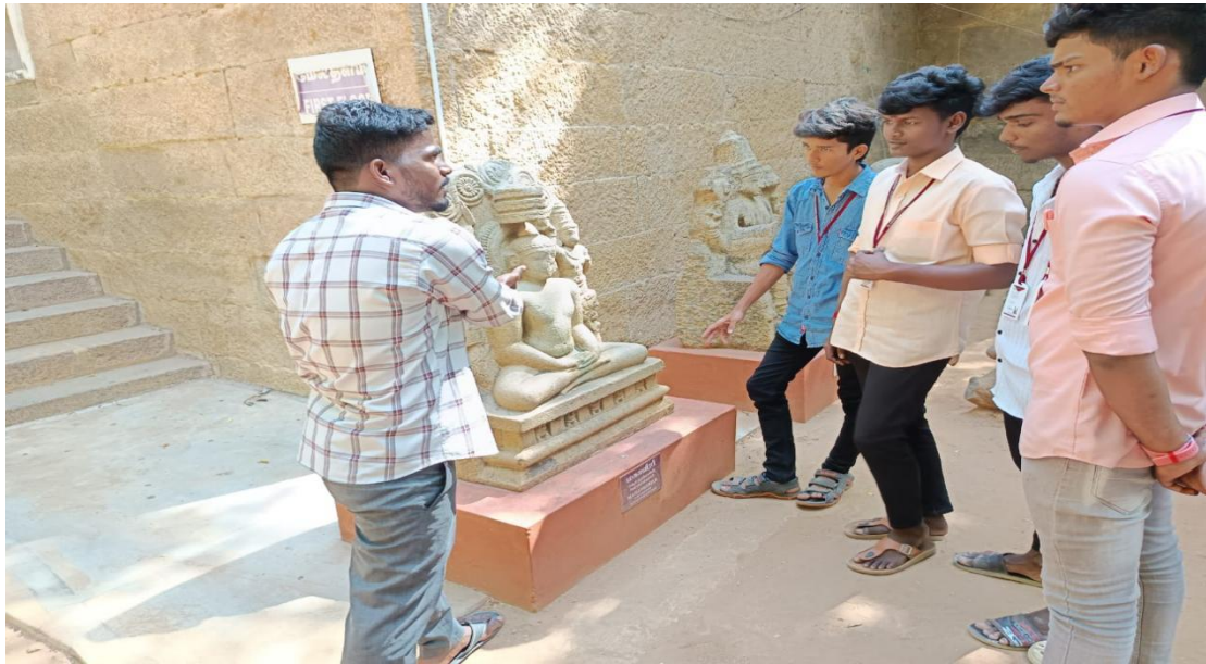
The Asst. professor offered an interpretation of the Jain Sculpture