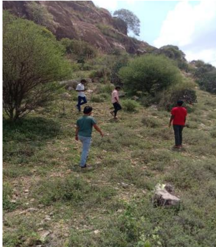
Asst Professors along with I B.A., students