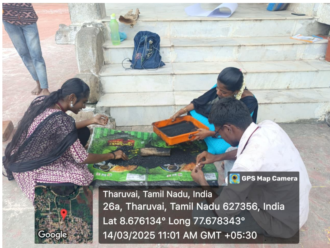
I B.A., Archaeology Students preparing Carbon ink

Through this hands-on training, all students gained proficient technical skills in these fundamental archaeological and epigraphical methods, thereby strengthening their practical understanding and field competence.