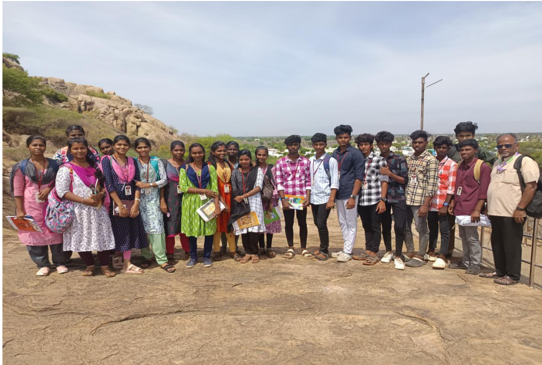
Professors and I B.A, Students, Kazhugumalai