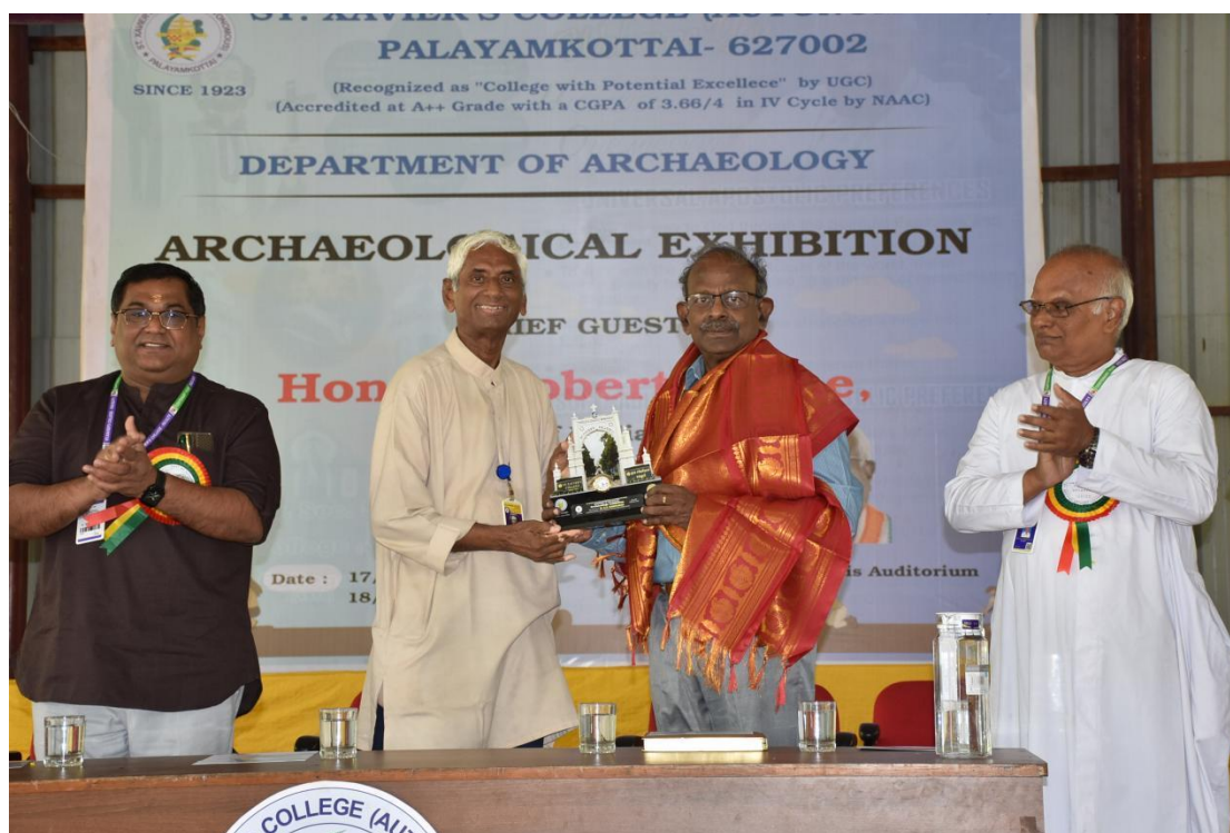
Rev Fr. Rector presenting a memento to the Chief Guest