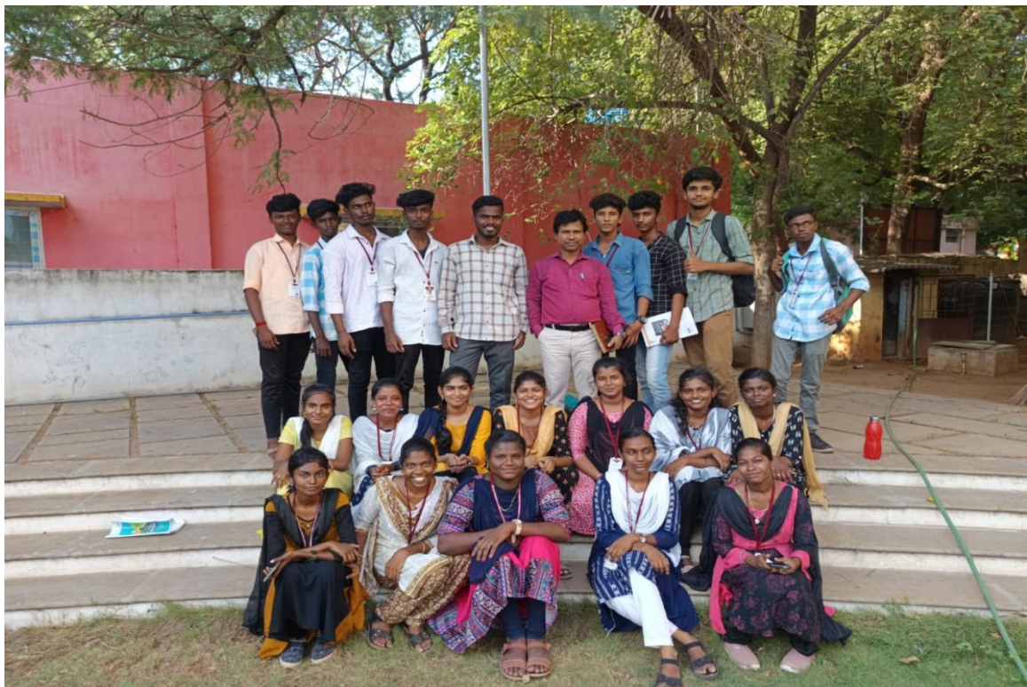
Asst. Professors and I B.A., Archaeology Students